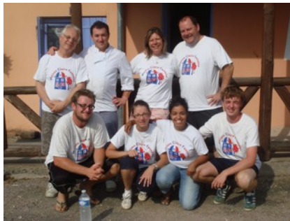
Autumn Team 2013